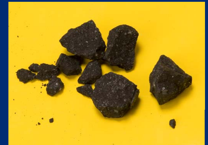
The Sutter's Mill meteorite. A CM-type meteorite that struck California in 2012 is rich in hydrated minerals.

We estimate that roughly 6% of NEOs should be hydrated. Adopting that fraction and making reasonable assumptions implies dozens of known NEOs 1 km and larger are hydrated, and hundreds are > 100 m in diameter and more accessible on a round trip than the surface of the Moon.